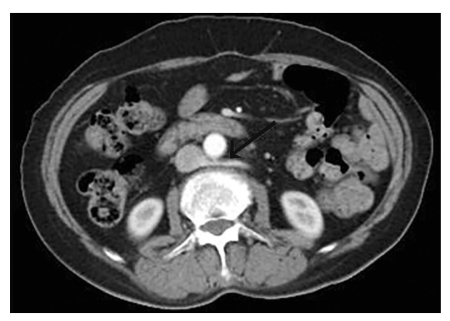
Figure 1. CT images revealed RLRV (red arrow) passing posteriorly to the abdominal aorta

During the laparoscopic exploration the mass was freed from medial attachments and partially mobilized. It was noted that there was no vein drainage from adrenal gland to the inferior vena cava (IVC). Once the mass was gently retracted laterally, an aberrant 0,5 cm wide vein was observed on the superior border of adrenal tissue. This vein was dissected meticulously from the adjacent tissues by using hook cautery. As this dissection completed, right adrenal vein was exposed arisen from accessory right hepatic vein (Figure 2). Adrenal vein was gently ligation with titanium clips and was then divided. Adrenalectomy was completed in a usual fashion. Total blood loss was less than 30 cc. Myelolipoma was rendered in histopathologic investigation.