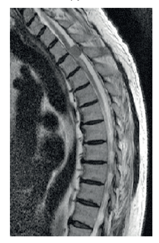
Figure 1. Magnetic resonance imaging findings of thoracic spine extramedullary intradural mass; suspicious meningioma at T2-3 level.

Hypoesthesia and deficit in deep sensory perception at the T4 level were present on physical examination. The reflex of patella tendon and the reflex of Achilles tendon were hypotonic. Lowerextremity motor weakness: right iliopsoas, quadriceps and hamstrings were grade 0, left iliopsoas, quadriceps, hamstrings were grade 1 and right and left tibialis anterior were grade 0 and 4, respectively. In addition, a significant spasticity (Ashworth 3) was present in both lower extremities and Babinski reflexes were bilaterally positive.