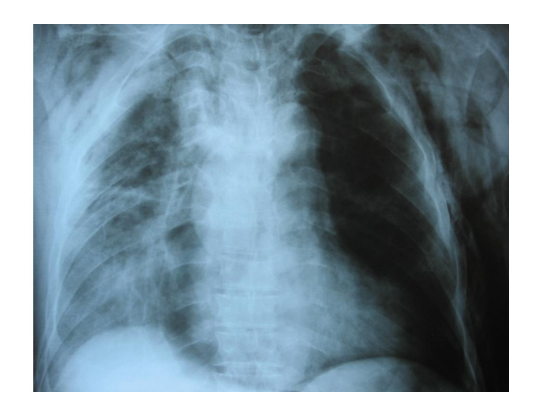
Figure 1: Plain PA Chest graphy of the patient.

5. Capizzi PJ, Martin M, Bannon MP. Tension pneumopericardium following blunt chest injury. J Trauma 1995; 39: 775-780.