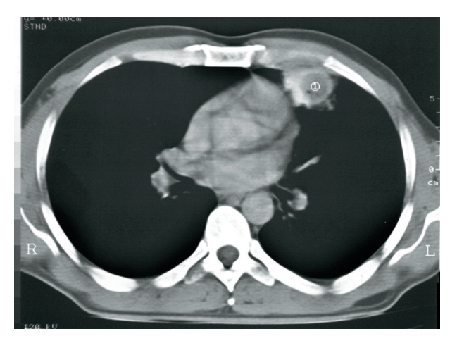
Figure 2. Computed tomographic scan of the thorax showing a cavitating lung mass.