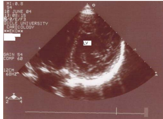
Figure 2. Two-dimensional echocardiography parasternal short-axis view of left ventricle. Excessive and prominent trabeculation of the left ventricle is visible.

LV: Left Ventricle, LA: Left Atrium, RV: Right Ventricle, RA: Right Atrium.